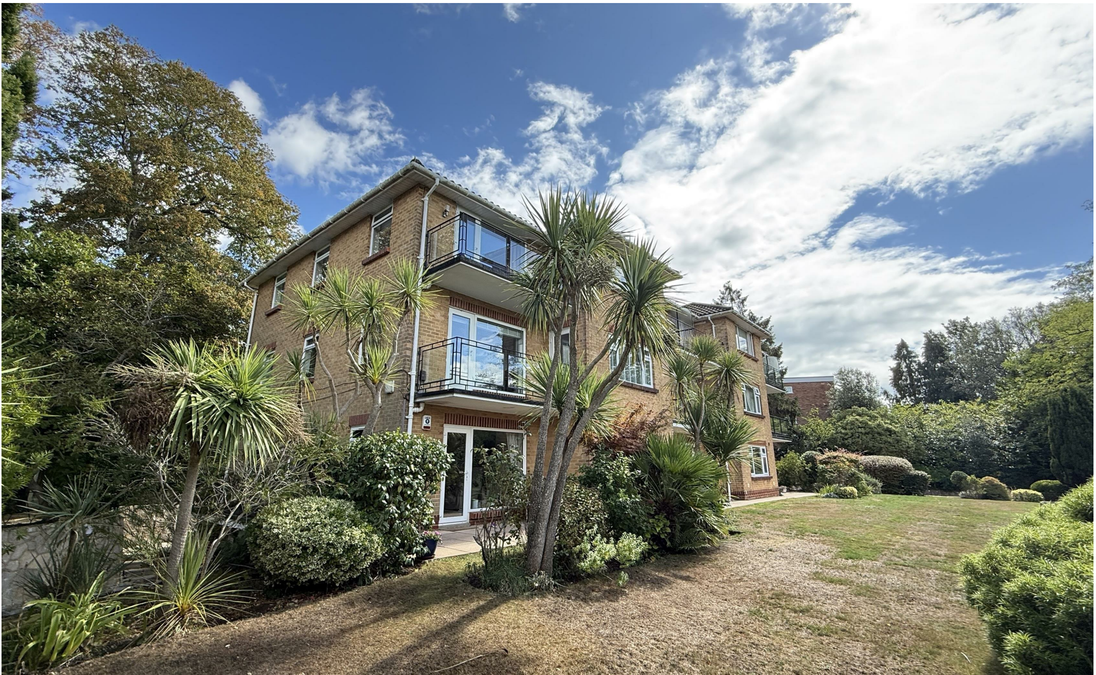
5 Pennington House 8 Grosvenor Road, Bournemouth BH4 8BL £380,000 Leasehold